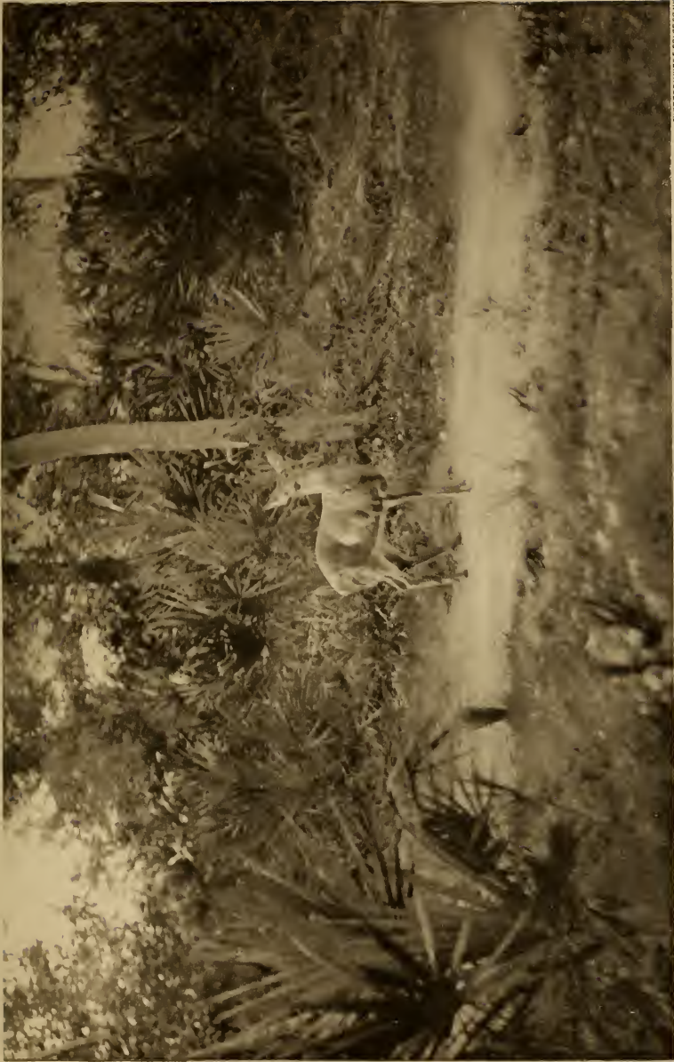
PHOTOGRAPHER & COLORIST